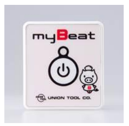
Fig. 1. Small Wearable Heart Rate Sensor (WHS-1)

We used IBM SPSS Statics (Version 22) for statistical processing of measured data with the level of statistical significance being 5%.